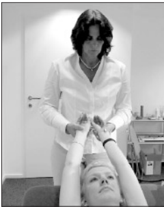
Muscle testing of arm Length using the REBA® test device

Psychosomatic Energetics™ (PSE) represents a new approach to healing and illness. According to its inventor, Dr. Reimar Banis, many chronic conditions are caused by energy blocks. Most important are inner blocks caused by hidden emotional conflicts. These conflicts block the flow of energy in the body. A blocked energy flow is often the main cause of disturbed metabolism in a segment or region of the body, which leads to many illnesses and complaints. Unlike psychotherapy, Dr. Banis claims that it's often not enough to bring these issues into consciousness, they need to be resolved in the body's subtle energy field. In many cases, psychotherapy is not necessary because the psyche's self-healing powers enable a person to harmonize and heal once the energy blocks have been treated.